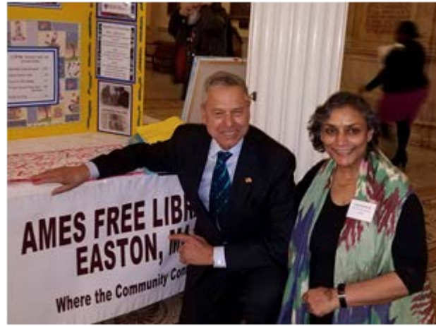
Ames Free Library Contingent