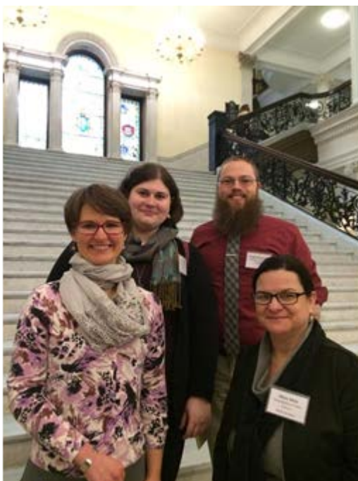
New Bedford Staff attending the 2018 MLA Legislative Day